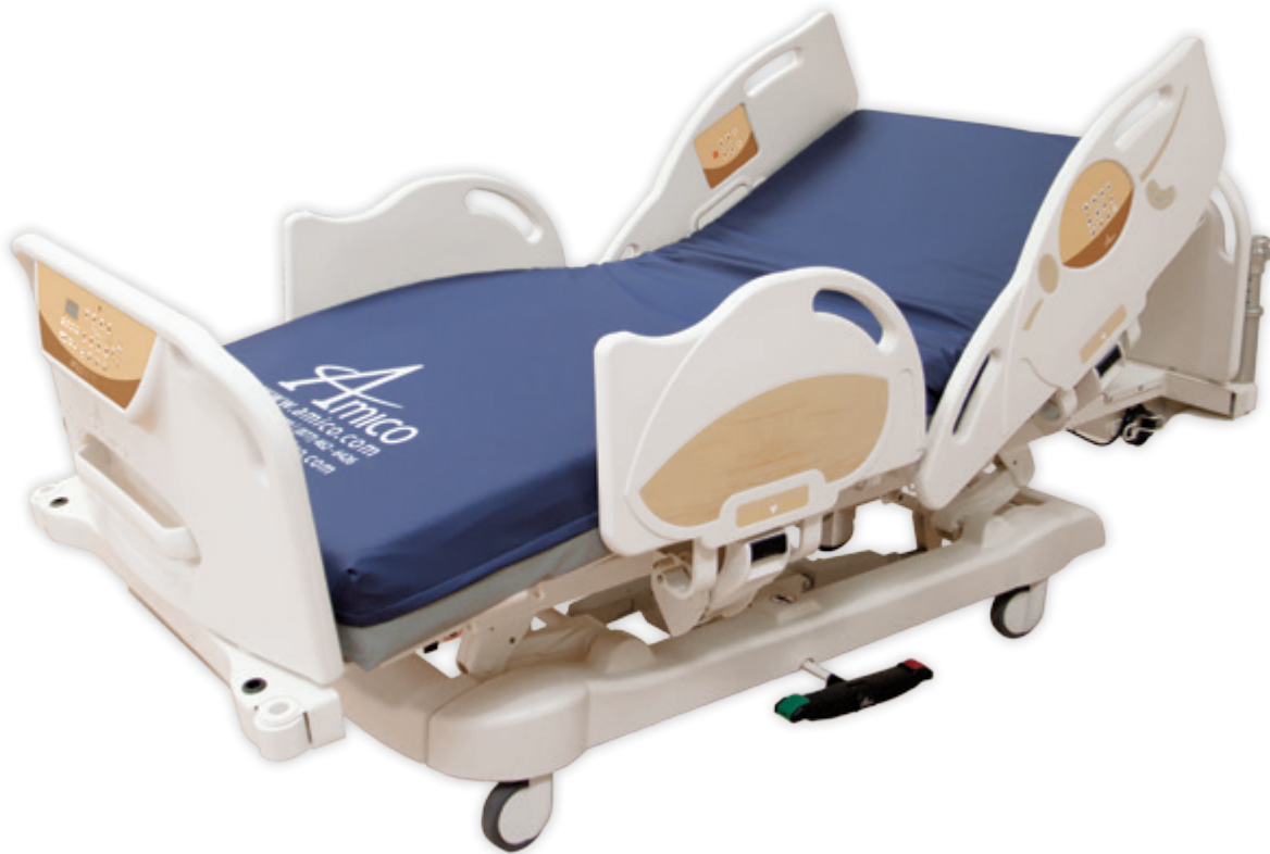
Apollo MS and Apollo MS-SC MedSurg Series Bed