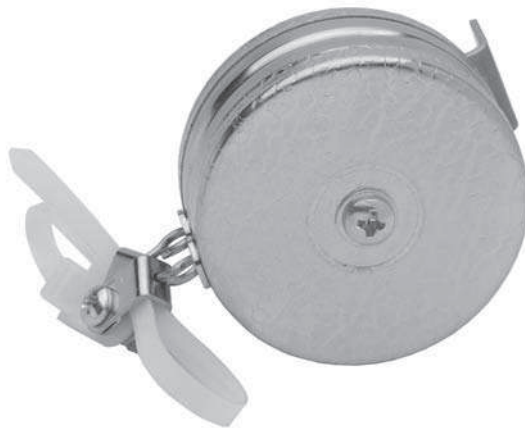
15-61-6006 Hose Retractor Available to attach directly to cover plate or to hose assembly.

All specifications are nominal and subject to change without notice.